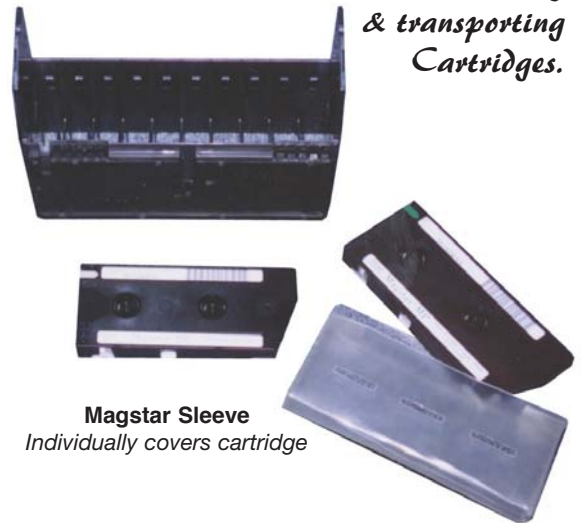
Magstar Sleeve Individually covers cartridge